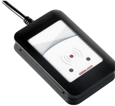
TWN4 MultiTech 2 LF (exemplary illustration)

The TWN4 MultiTech 2 family of contactless RFID readers and modules allows users to read and write to almost any LF and HF tags and labels. All products support NFC and, optionally, Bluetooth Low Energy (BLE). In addition, they are also compatible with the two most commonly used smartphone operating systems, Android and iOS, which gives the option to integrate them in mobile identification applications. The desktop readers are available as Plug & Play devices that can be easily customized (i.e. inlay design), whereas the PCB modules offer a large amount of interfaces and a perfect form factor for an easy and quick integration in any host device. This broad range of product features makes the TWN4 MultiTech 2 family an excellent solution for almost every project.